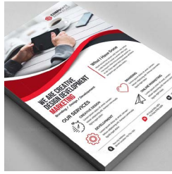
Handout Inserts $1,500