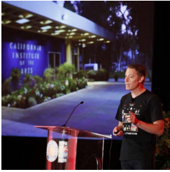
Keynote Sponsors $3,500