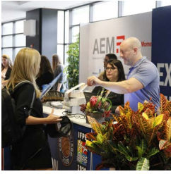
Welcome Sponsor $5,000

For sponsorship information, contact your Account Success Advisor. Email exhibitors@aem.org or Call 866-236-0442 or 414-227-0943 .