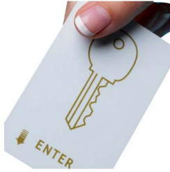
Hotel Key Cards $4,000