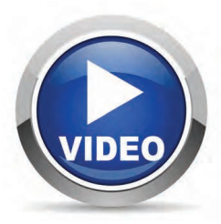
Commercial Video Sponsor $7,500