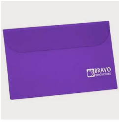
Registration Packet $2,500